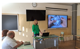
EXAMPLES OF CLIL LESSONS SPAIN AND TURKEY