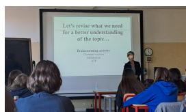
SCIENZE IN ENGLISH CLIL LESSONS