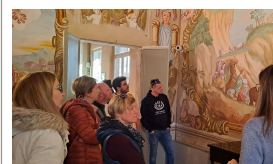
CULTURAL VISITS PADOVA